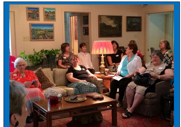
At the Rush