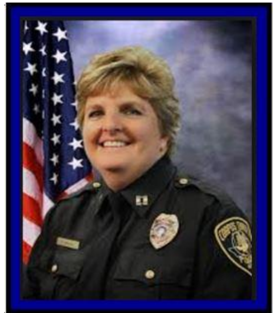
AAUW CC Branch Meeting Saturday, April 7 th at 10AM YWCA 4639 Corona Dr.