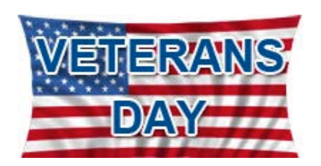
November 11 Honoring All Who Served

We have some busy times coming up. We will have our Christmas luncheon at the Mirador on December 7, and will continue our tradition of silent auction and gift card raffle. We will once again provide gifts for the YWTeens so that they can select Christmas gifts for members of their families. We will help them wrap the gifts after they have made their selections. Please consider volunteering for this fun afternoon.