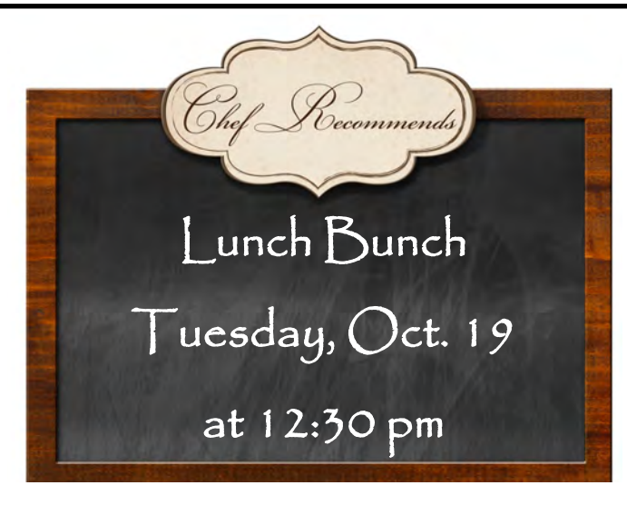
From Susan Birchfield

The Lunch Bunch will be meeting at 12:30 pm on Tuesday, Nov. 19th. We will be meeting at Cafe Italia, located at 4117 S Staples.