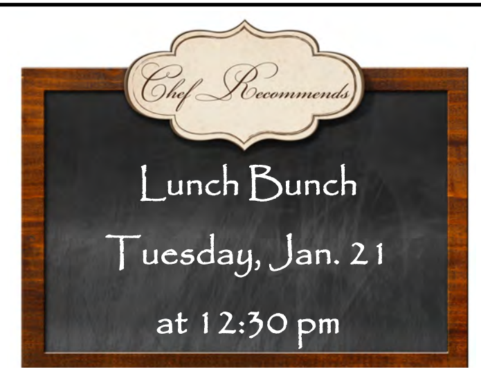
From Susan Birchfield

Lunch Bunch will be meeting on January 21st at 12:30 pm at The Blue Clove, located at 5884 Everhart.